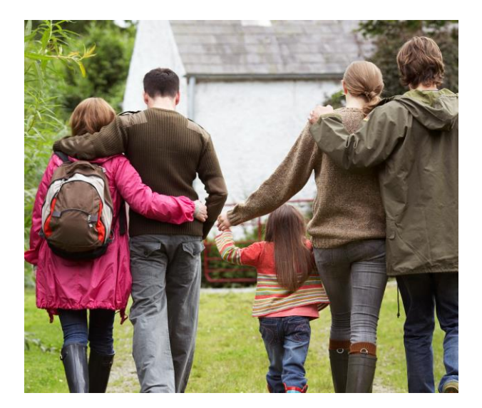
Sibling Survivor Guilt originally published in The Compassionate Friends Magazine <u>We Need Not</u> <u>Walk Alone</u>, Summer 1998, p.15, 17.